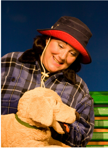
As Eleanor in "Deckchairs – Doggies"