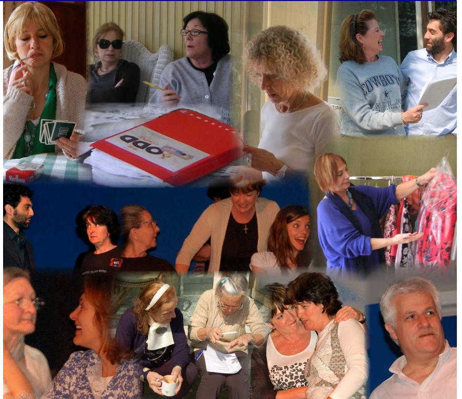
Cast and Crew in a whirl of activity

Please collect your reserved tickets half an hour before curtain up. Uncollected tickets, together with any unreserved tickets, will be sold at the door before each performance.