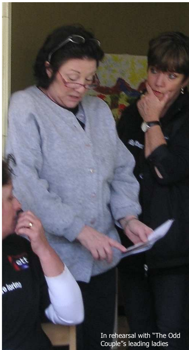
In rehearsal with "The Odd Couple's" leading ladies