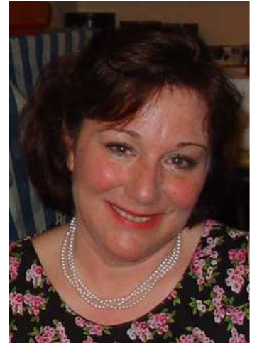
As Lenny in "Crimes of the Heart"